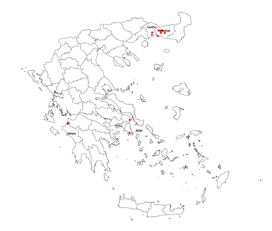
Figure 2: Map showing the estimated place of exposure of reported cases with laboratory diagnosed WNV infection, Greece, 2014 (n=15)*.

Calculations based on 2011 census data (Hellenic Statistical Authority).