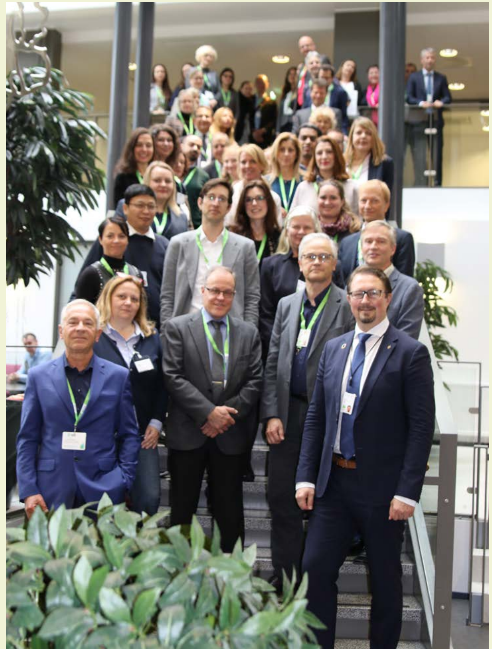
SHARP JA partners

The partners collaborate with the ECDC and the WHO European Office in relevant activities; plus, other European joint actions, specifically the Healthy Gateways Joint Action that addresses Points of Entry and Joint Action TERROR that improves response to biological and chemical terror attacks.